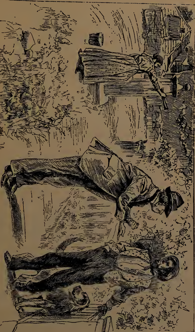
“WHITE FOWED, IN WORDS PROFANELY DEEP, THAT BROWN’S CANINE HAD KILLED HIS SHEEP.”